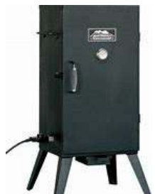
DRAWING APRIL 26

DON'T FORGET TO ENTER THIS MONTH'S DRAWING FOR A CHANCE TO WIN A MASTER- BUILT SMOKER.